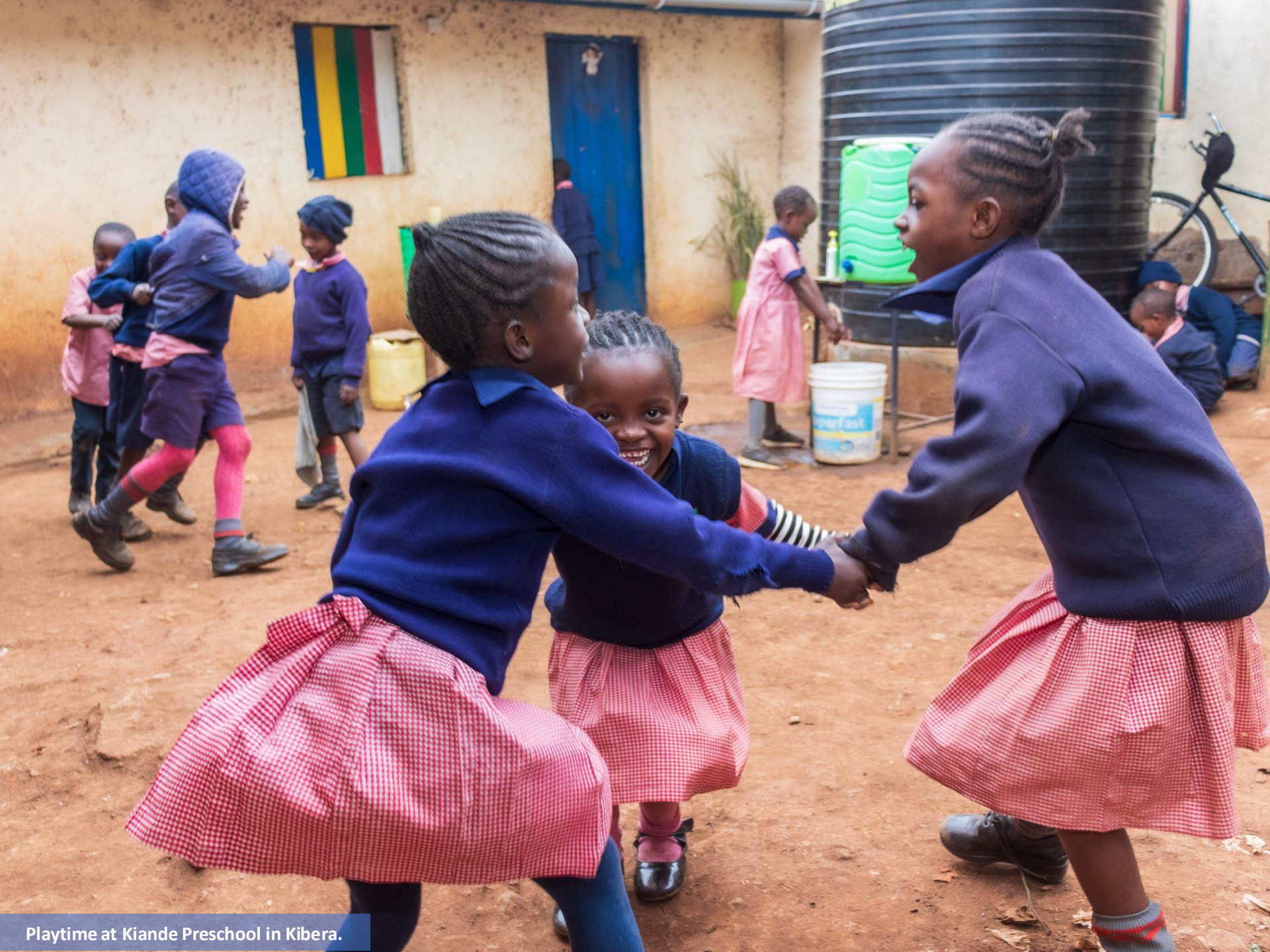
Playtime at Kiande Preschool in Kibera.