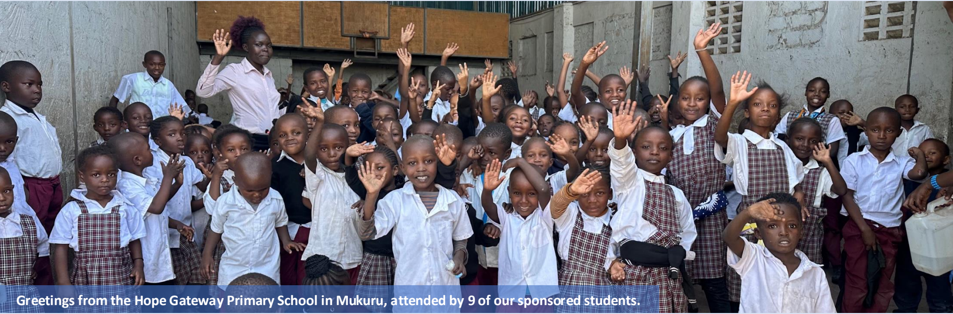
Greetings from the Hope Gateway Primary School in Mukuru, attended by 9 of our sponsored students.

All in '000s USD rounded to the nearest $100.